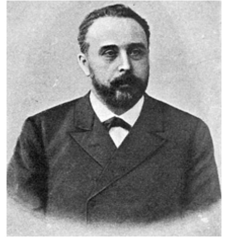
Sergei SHEREMETEV Graph