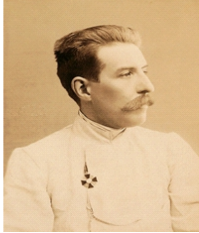
De-Bai French Baron